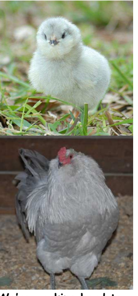
We're working hard to produce some of the finest quality lavender Ameraucana available.